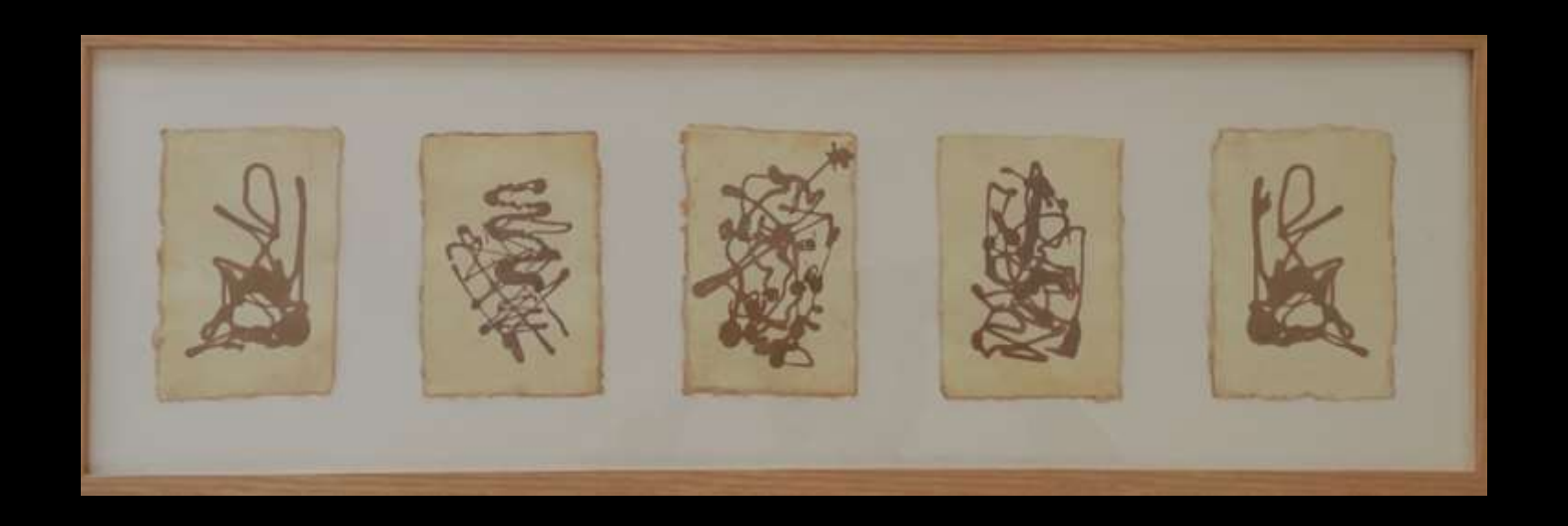
2ft x 1ft (set of 5 pieces)