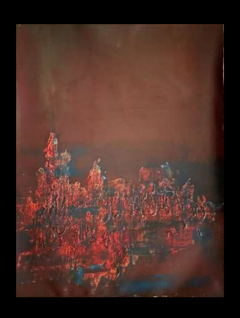
1.5ft x 1ft