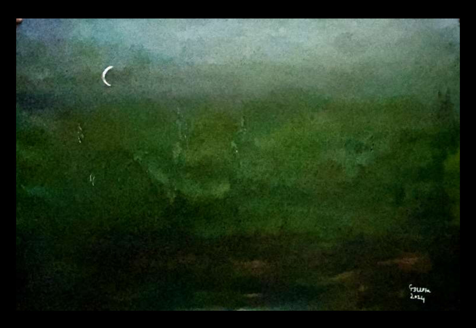
3ft x 2ft