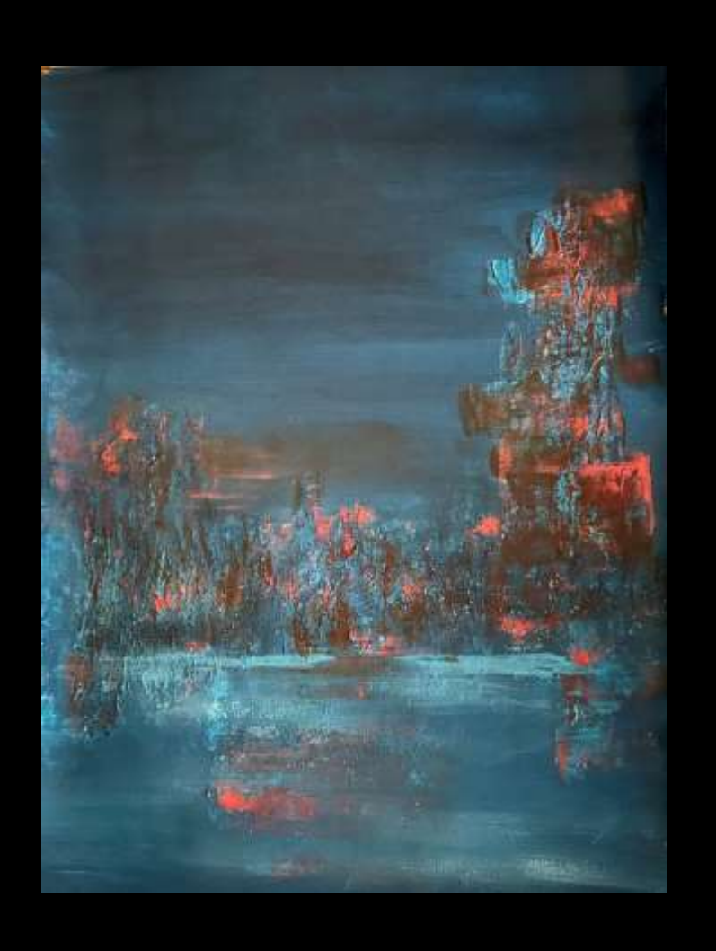
1.5ft x 1ft