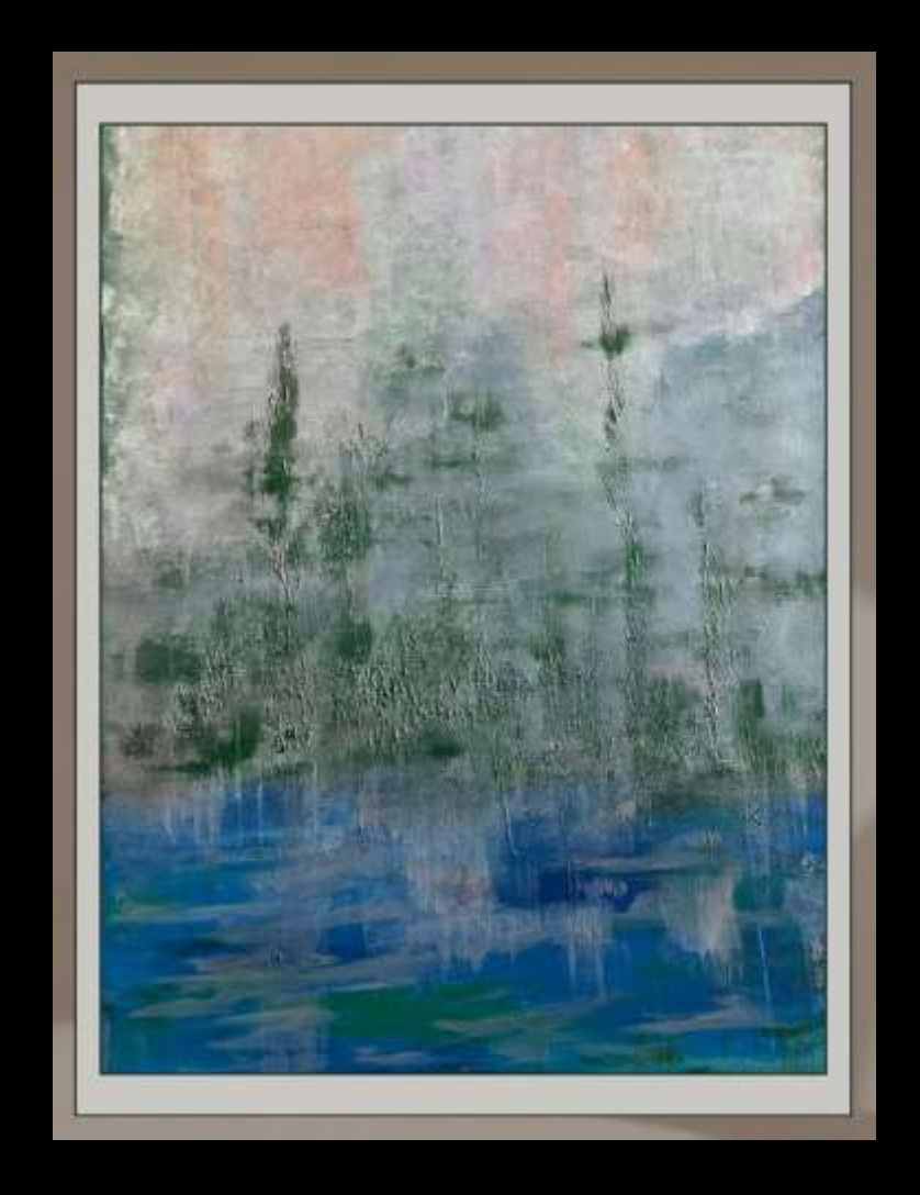
5.5ft x 4.5ft