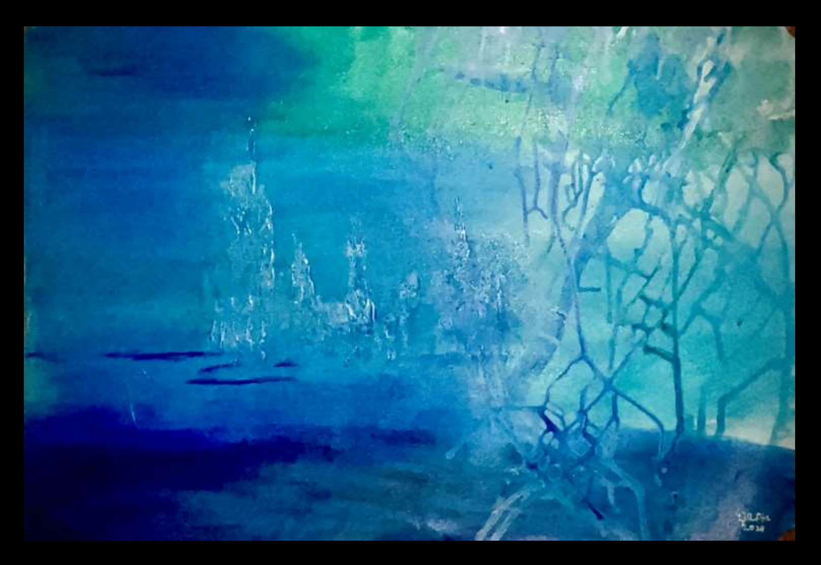
3ft x 2ft