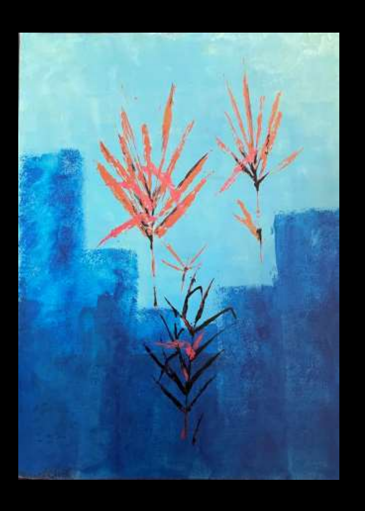
2ft x 1.5ft