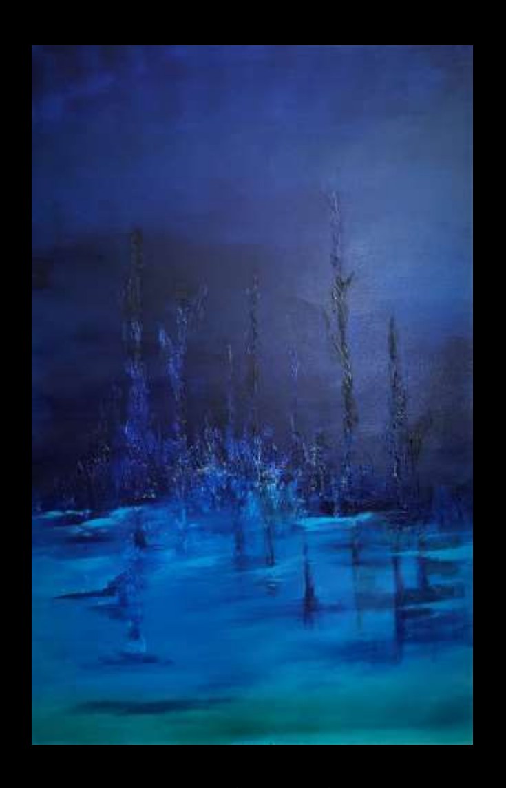
5.5ft x 4.5ft