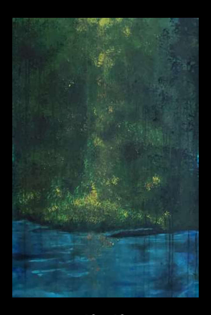
3ft x 2ft