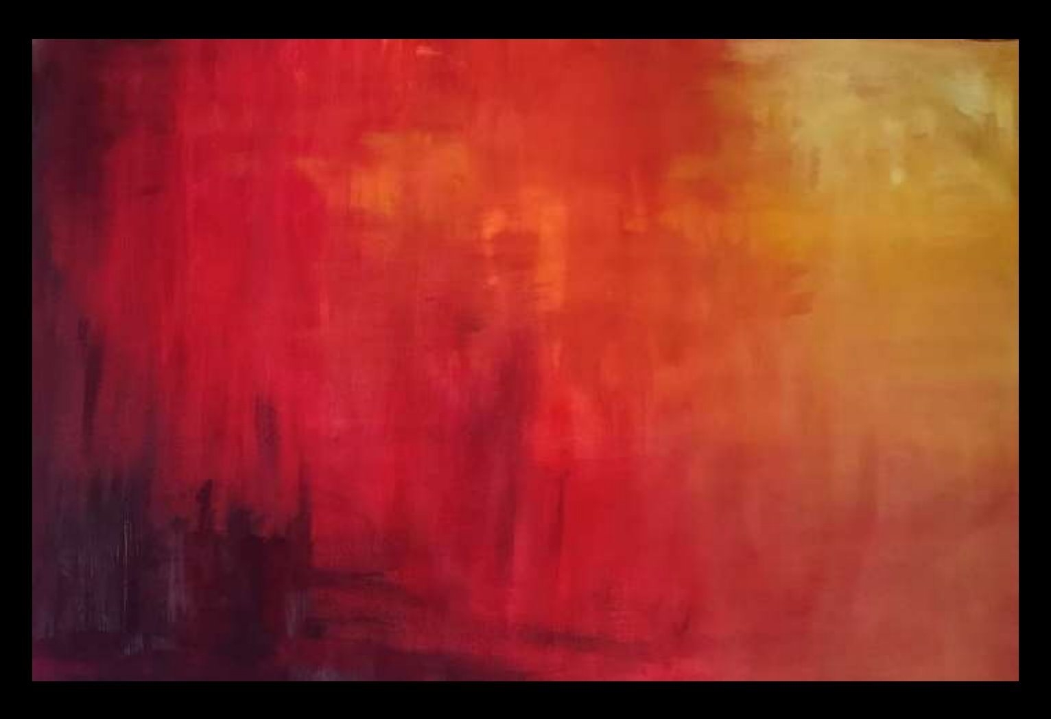
3ft x 2ft