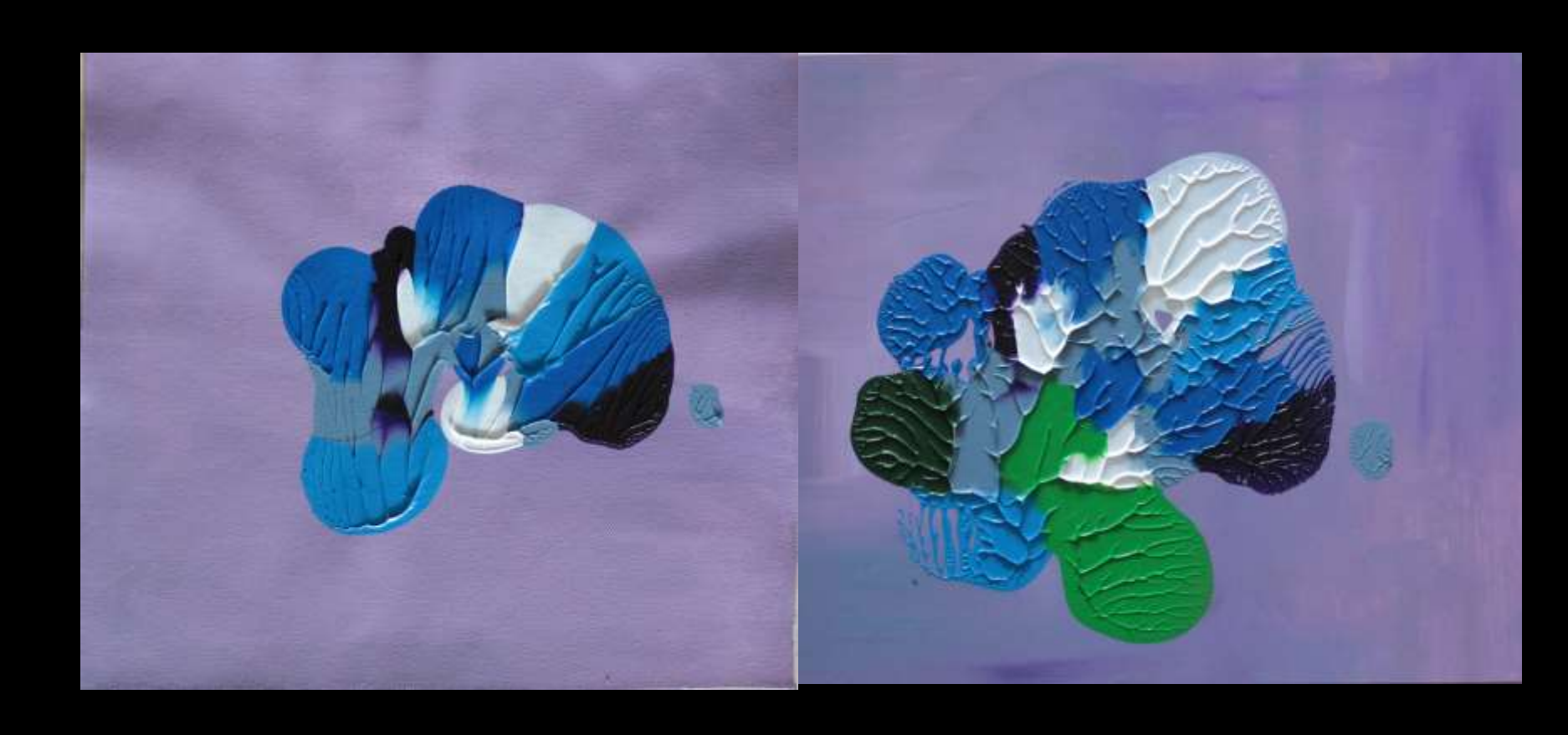
1ft x 1ft (2 pieces)