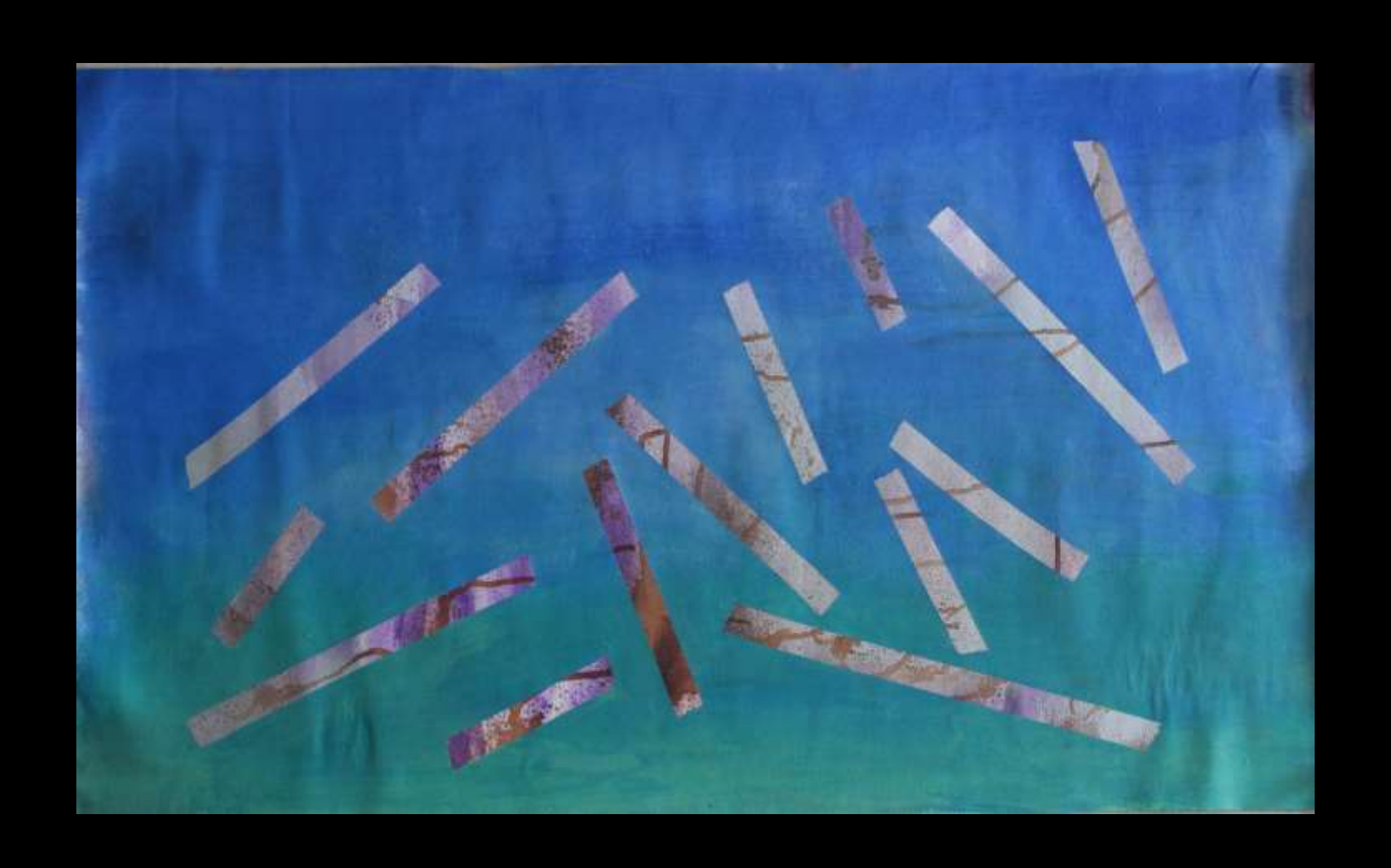
3ft x 2ft