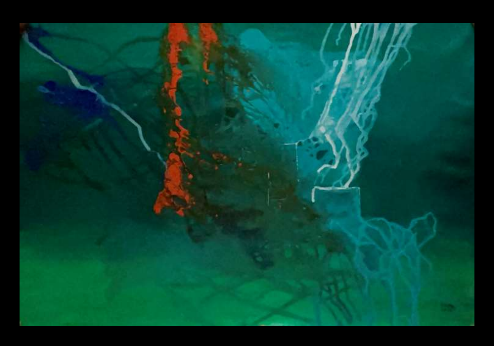
3ft x 2ft