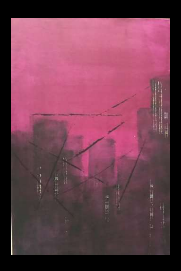
3ft x 2ft