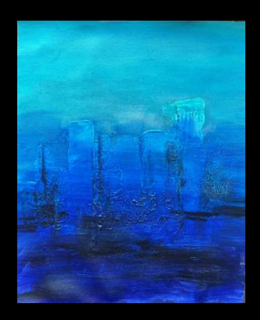
1.5ft x 1ft