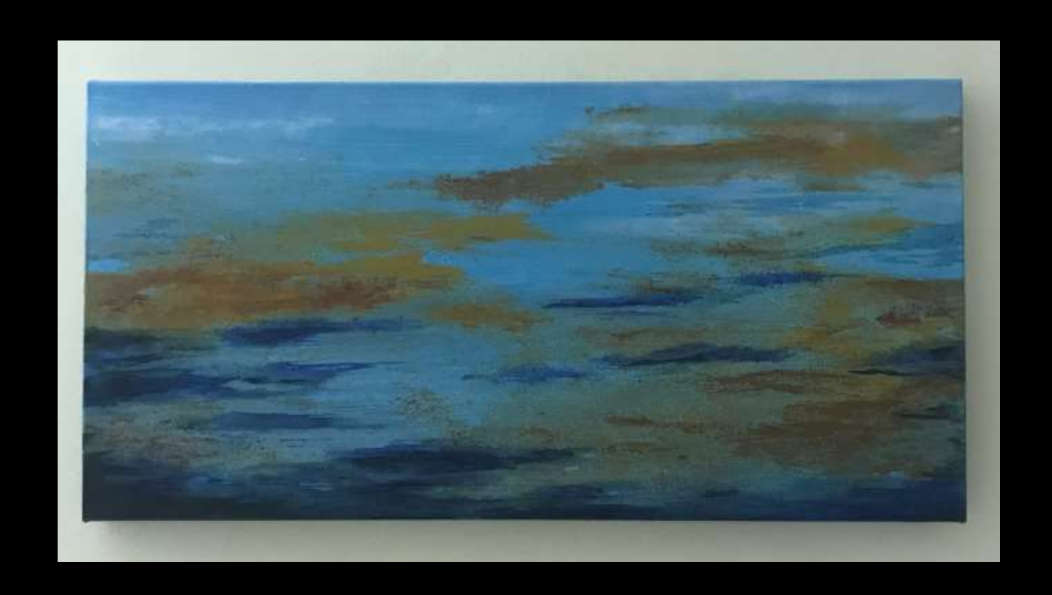
1.75ft x 1ft