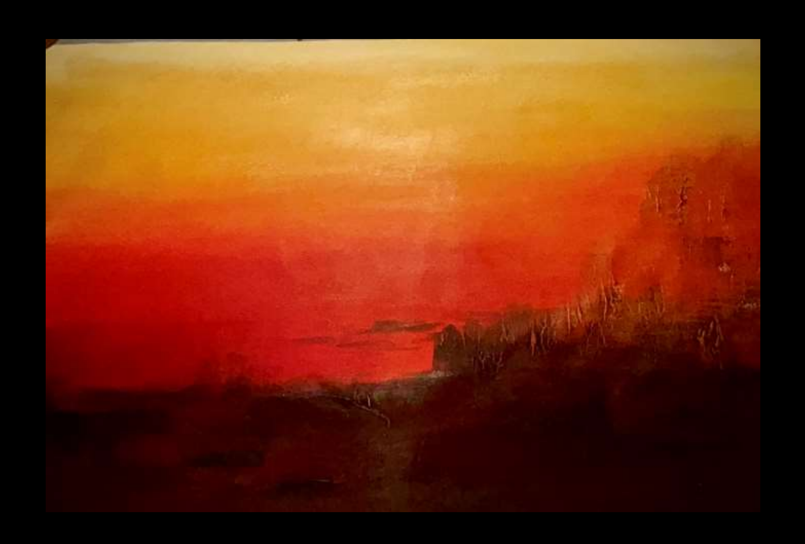
3ft x 2ft