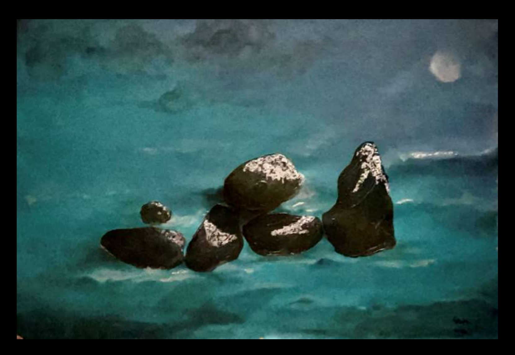
3ft x 2ft