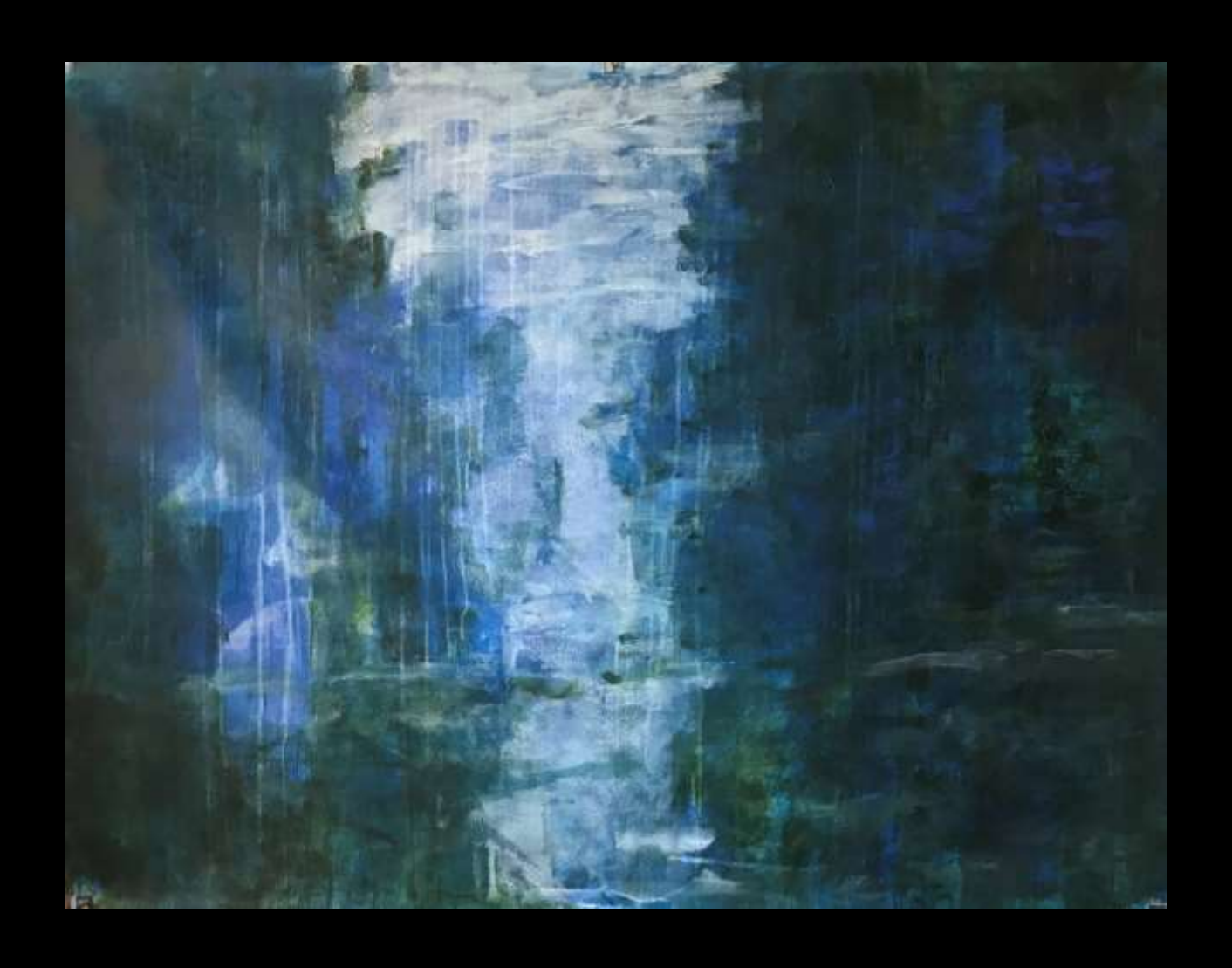
4ft x 3ft